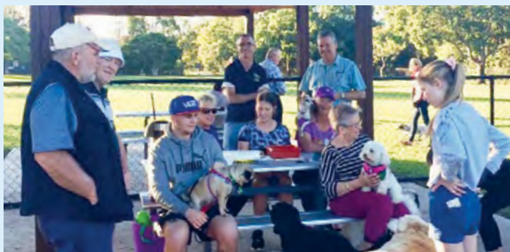
PROUDLY LOCAL: It is great to see so many people enjoying the new shelter at Three Paddocks Park's dog off-leash area.