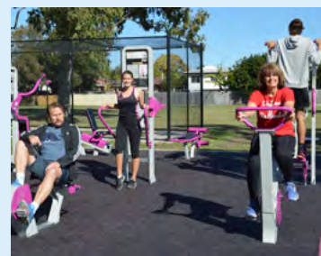
WORK OUT: Trying the new equipment at Three Paddocks Park.