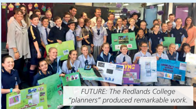
FUTURE: The Redlands College "planners" produced remarkable work.

Council is organising an on-site community consultation for 10am-2pm on Saturday 23 September to discuss possible further uses of the park, such as barbecues, amenities and a playground. I would really appreciate input from the locals and users of the park to ensure any further enhancements are what the community would like to see.