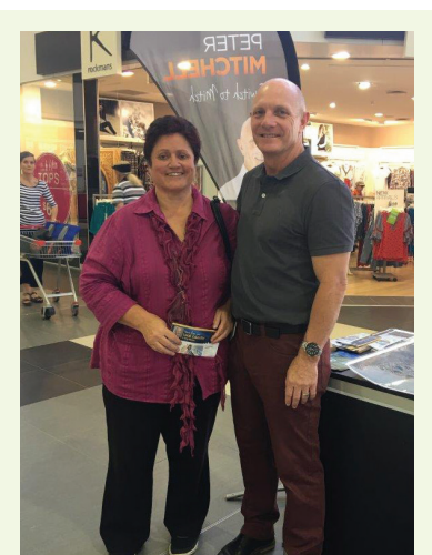
POP-IN: Listening to your views.

I will vary the times and days to reach as many people as possible, so keep an eye on @councillorpetermitchell on Facebook or call my office on 3829 8607.