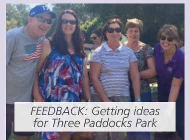
FEEDBACK: Getting ideas for Three Paddocks Park

Thank you to everyone who attended the recent Three Paddocks Park consultation day. Playgrounds, toilets, carparks and seating were discussed and I value all the feedback. Early in the New Year I look forward to consulting again with the outcome of the day!