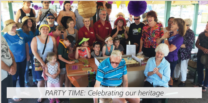
PARTY TIME: Celebrating our heritage

Going forward we must protect all that we have while still building a sustainable local economy, with tourism delivering positive benefits for our city.