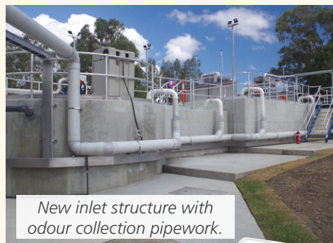
New inlet structure with odour collection pipework.