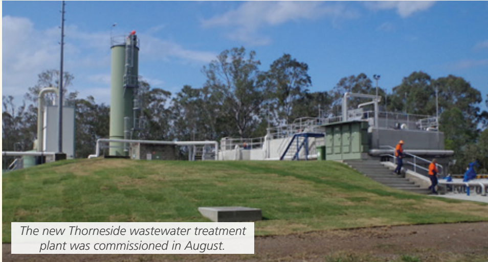
The new Thorneside wastewater treatment plant was commissioned in August.

The Thorneside wastewater treatment plant works has recently undergone a major upgrade with Council and the State Government investing $3.6 million to replace old and ineffective equipment and reduce odour emissions for local residents.