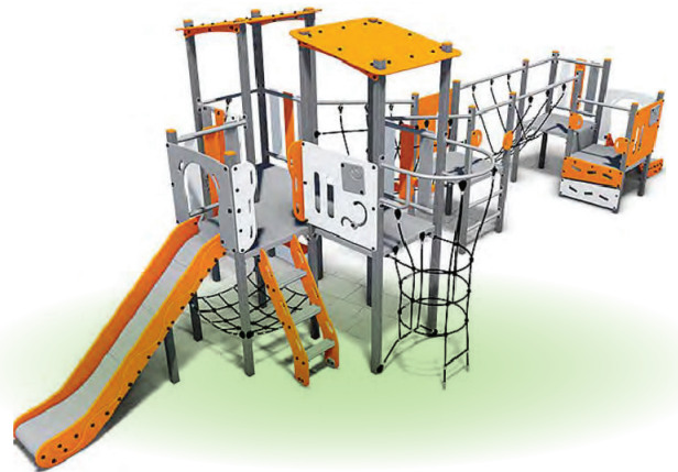
LEFT: The new location of the Bailey Road Park toilets. ABOVE: The play unit for Montgomery Drive Park.