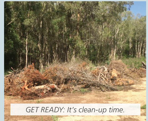
GET READY: It's clean-up time.