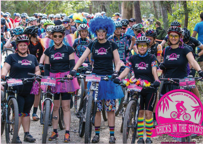
ON A ROLL: The Chicks in the Sticks three-hour enduro event at Mt Cotton's Karingal Scout Camp.

It adds to the success of RATS Cycling Club, whose Bayview Blast has won a spot in the five-event National Marathon Series for 2018. The Bayview Trail Park is well and truly on the map and is becoming an important and popular venue for local and visiting riders.