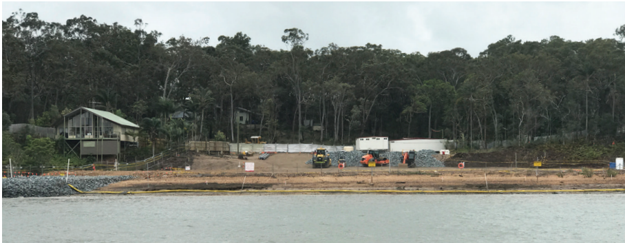
UNDERWAY: Work has started on the Macleay Island foreshore capping and carpark.