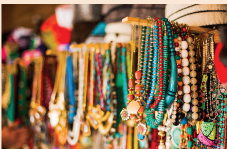
JEWEL: Karragarra is well worth the visit.

A total of 40 bicycles will also be able to be stored on racks.