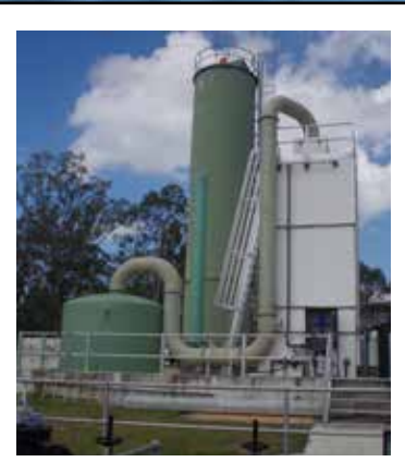
TREATMENT: The plant's bio-trickling filter and new activated carbon unit.

The new inlet structure is now operating to its design expectations. It is expected there will be an official grant acknowledgement and opening in the near future.