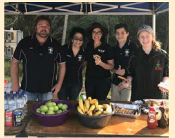
HOSPITALITY: With the team from Mount Cotton Scouts catering for the Bayview opening.

Ranger Stacie from Totally Wild joined in the fun and was a favourite with the kids - as was the opportunity to get up close to some of our native animals at a wildlife display.