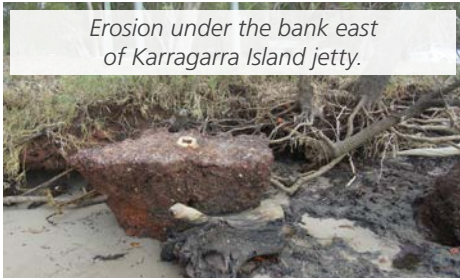
Erosion under the bank east of Karragarra Island jetty.