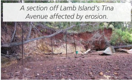
A section off Lamb Island's Tina Avenue affected by erosion.