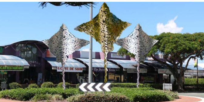
APPEAL: An artist's impression of the stunning entry statement that will greet people to Wellington Point village.