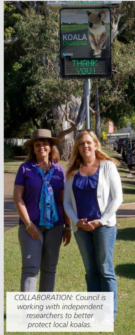
COLLABORATION: Council is working with independent researchers to better protect local koalas.

To continue to develop the changes needed to help stem decline, we need to work together to ensure our