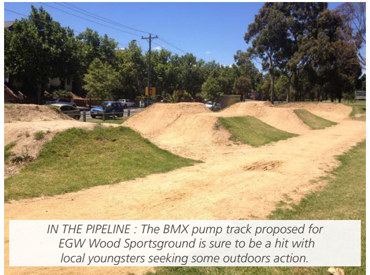
IN THE PIPELINE : The BMX pump track proposed for EGW Wood Sportsground is sure to be a hit with local youngsters seeking some outdoors action.