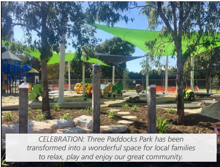
CELEBRATION: Three Paddocks Park has been transformed into a wonderful space for local families to relax, play and enjoy our great community.

There are other items on my priority list which I am working to have included in next year's budget.