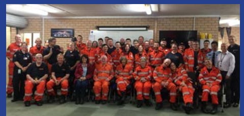
SERVICE: We are blessed to have dedicated police officers and SES volunteers serving Redlands Coast.