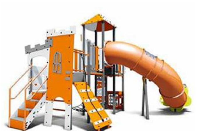
FUN TIMES AHEAD: An example of the play structure proposed for Goodall Street Park.