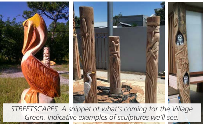
STREETSCAPES: A snippet of what's coming for the Village Green. Indicative examples of sculptures we'll see.

Making our local villages inviting spaces which are visitor friendly is important to our economic future, so I am excited to see our local upgrades by Council are underway.