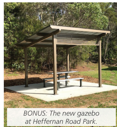
BONUS: The new gazebo at Heffernan Road Park.