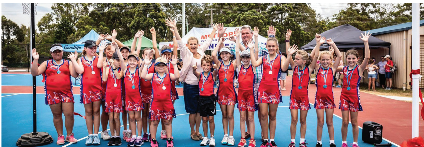
GOOD SPORTSL: The Meteors Netball crew celebrate their new facilities at Alexandra Hills' Keith Surridge Park, on Windemere Road.

At Heffernan Road Park, the recent refurbishment has been complemented by a gazebo and water bubbler.