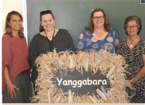
PARTNERSHIP: A collaborative arts project is helping to provide a safe place for local students and the community at Birkdale South State School.