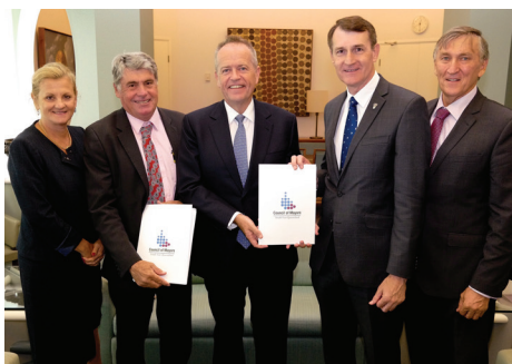
Working with the SEQ Council of Mayors.

At the same time, we are also pressing the State Government for better localised transport services, such as a free bus from key transport nodes (including our marinas) to the Redlands Hospital precinct, which would particularly benefit island and older residents.