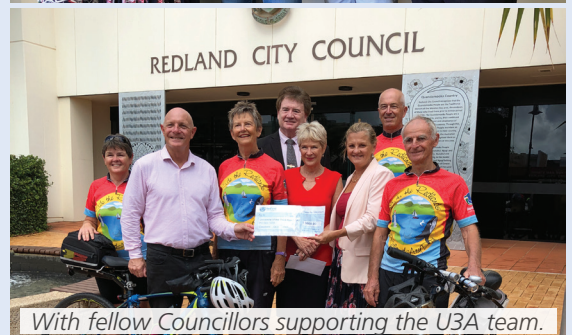
With fellow Councillors supporting the U3A team.