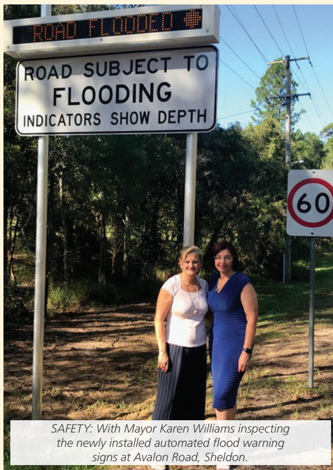
SAFETY: With Mayor Karen Williams inspecting the newly installed automated flood warning signs at Avalon Road, Sheldon.