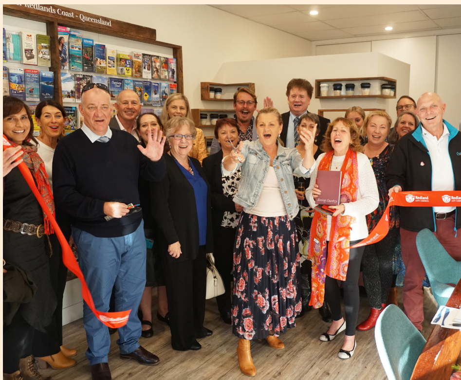
WELCOMING: The official opening of our new Visitor Information Centre at Cleveland's Raby Bay Harbour.