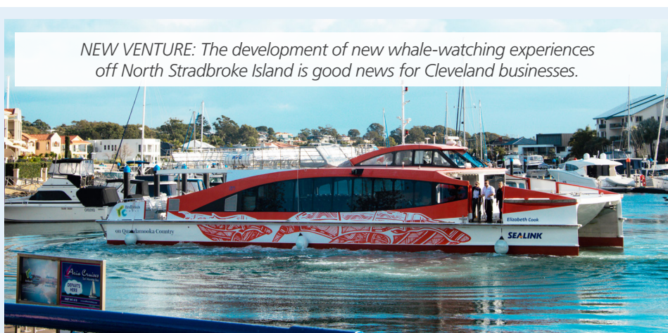
NEW VENTURE: The development of new whale-watching experiences off North Stradbroke Island is good news for Cleveland businesses.