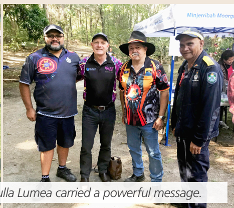
VOICE. TREATY. TRUTH: This year's NAIDOC celebrations at Ron Stark Oval and Terra Bulla Lumea carried a powerful message.