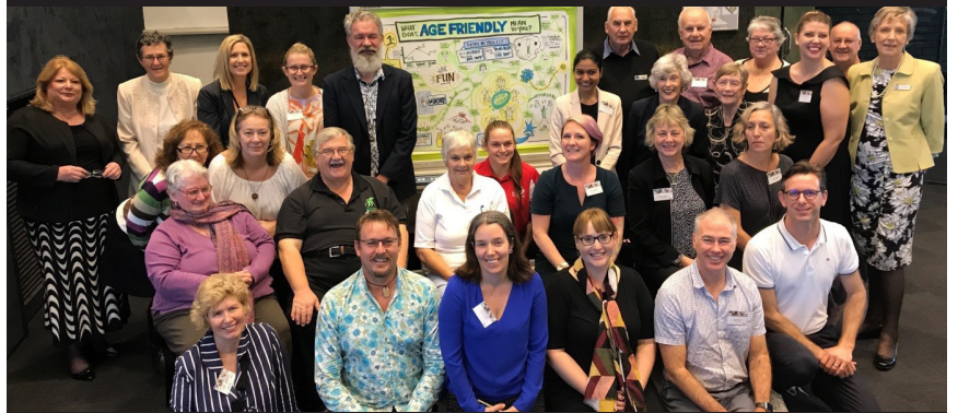
COMMUNITY: Supporting Age Friendly Futures at a recent Department of Communities workshop at the Redland Performing Arts Centre.

The new Redlands Coast mobile library is smaller and can now get to more places. I've requested visits to local retirement villages. If any seniors or residents with reduced mobility would like access to Council's free mobile lending services, please contact me or email library@redland.qld.gov.au