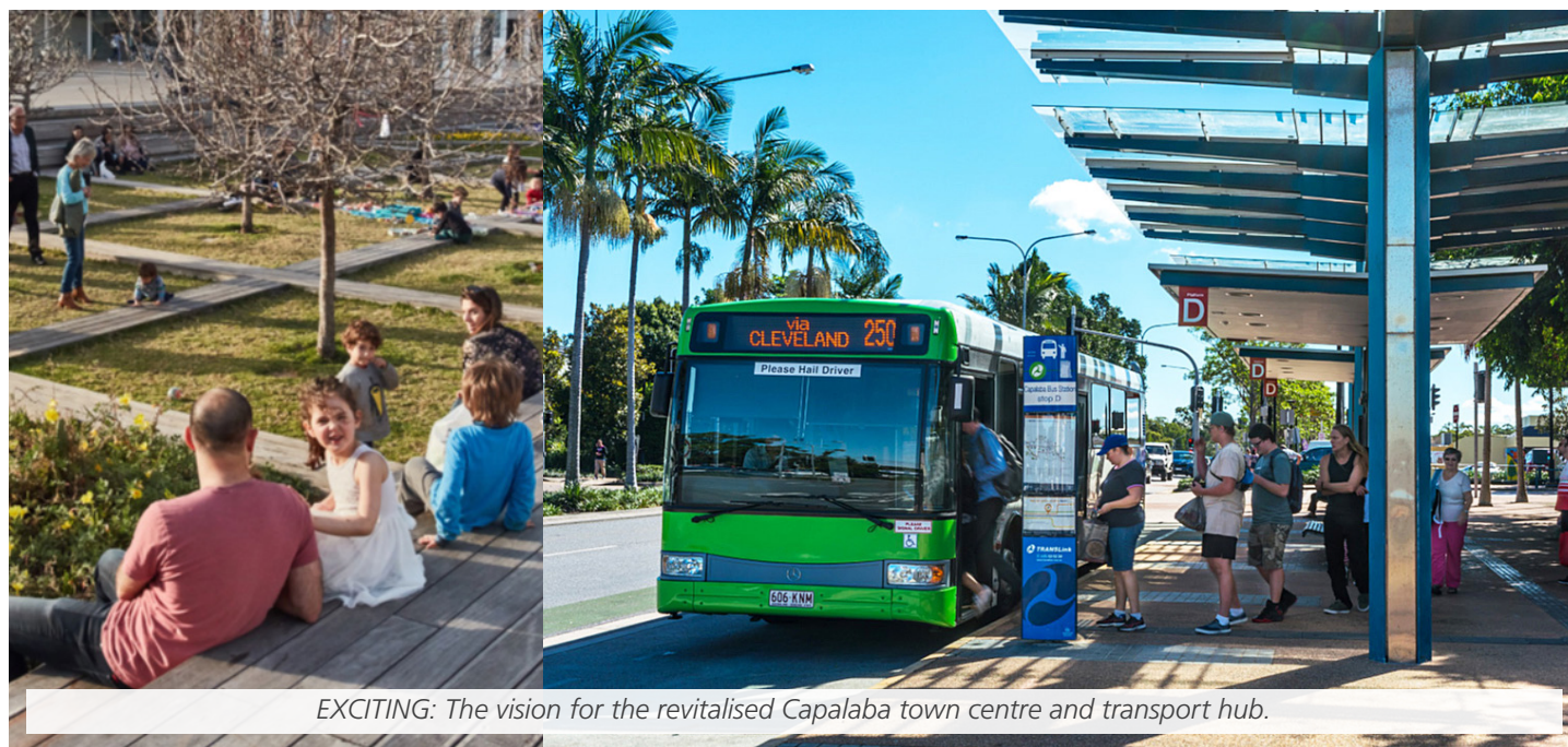
EXCITING: The vision for the revitalised Capalaba town centre and transport hub.

A preferred developer will be selected later this year and we will then work to refine the plan and work through all the necessary approvals.