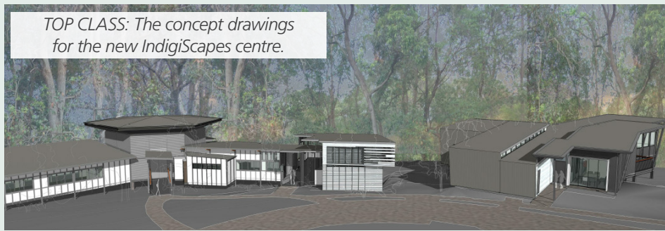
TOP CLASS: The concept drawings for the new IndigiScapes centre.