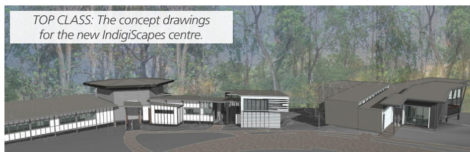
TOP CLASS: The concept drawings for the new IndigiScapes centre.

The work on our local parks is set to continue with Wimbourne Road Park getting a new shade structure and play equipment, David Parr Park to get a shade sail over the new playground and Hyde Court Park to be landscaped to make it an area for natural relaxation.