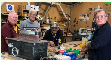
COMMUNITY: Some of the crew at the Alexandra Hills Men's Shed, where Council has helped fund a new dust extractor.

They meet in the mornings from 8am at the Williams Street sheds and are happy to help anyone who has a project.