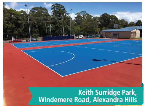
Keith Surridge Park, Windemere Road, Alexandra Hills