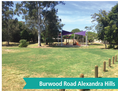
Burwood Road Alexandra Hills