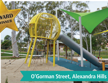
O'Gorman Street, Alexandra Hills