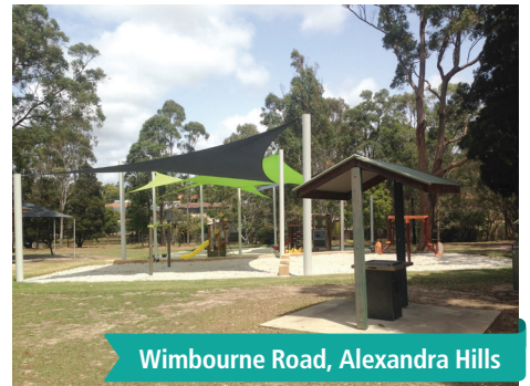
Wimbourne Road, Alexandra Hills