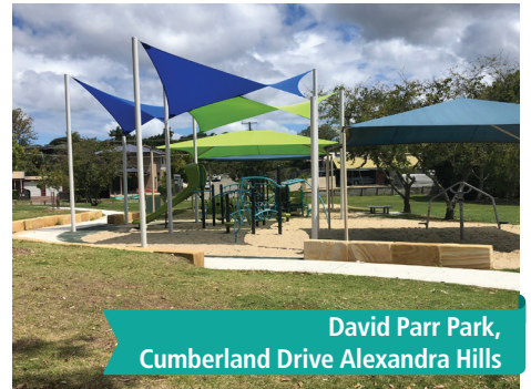
David Parr Park, Cumberland Drive Alexandra Hills