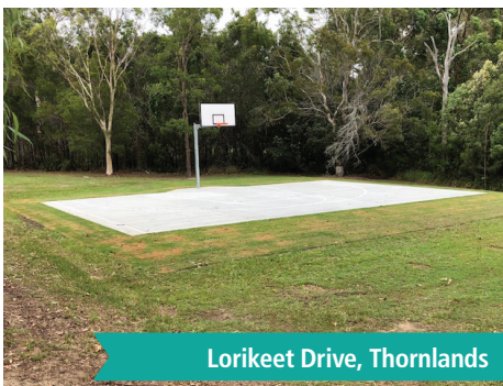
Lorikeet Drive, Thornlands