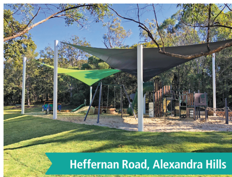
Heffernan Road, Alexandra Hills