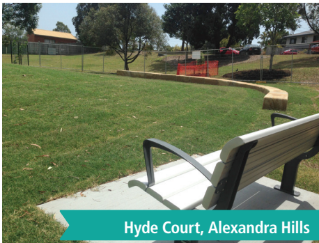
Hyde Court, Alexandra Hills