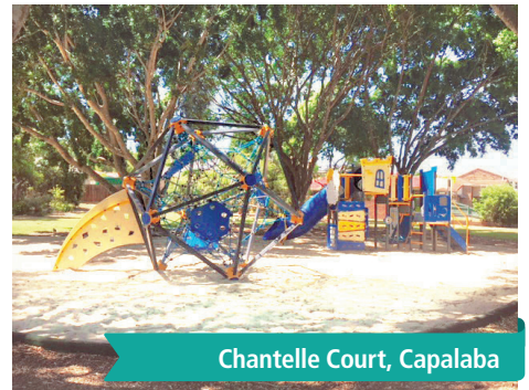
Chantelle Court, Capalaba