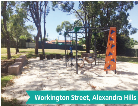
Workington Street, Alexandra Hills