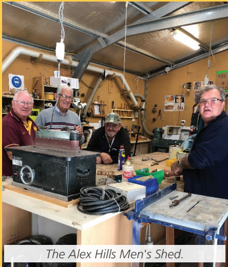
The Alex Hills Men's Shed.

All up, more than $54,700 has been distributed to groups such as: