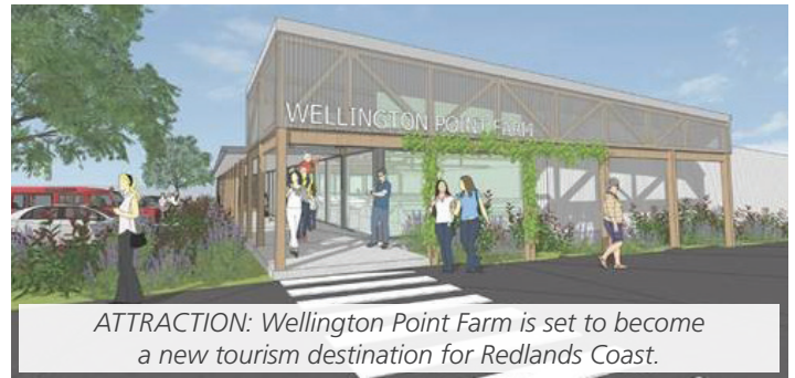
ATTRACTION: Wellington Point Farm is set to become a new tourism destination for Redlands Coast.

Please continue to stay in touch and feel free to email me at wendy.bogлары@redland.qld.gov.au or call 3829 8619 or 0408 543 583 if I can assist.