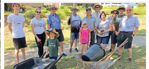
CARING: The Sovereign Waters Bushcare group has been helping to improve our environment and, top, Koala Action Group members planting at Bligh Street.