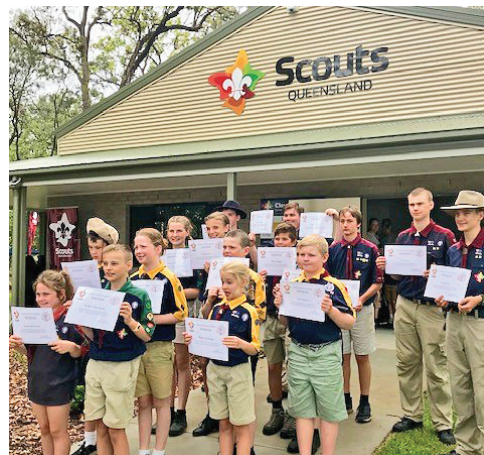
RESILIENCE: It was great to see so many happy faces at the opening of the new Scout hall.