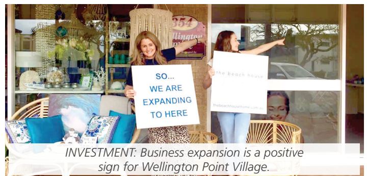
INVESTMENT: Business expansion is a positive sign for Wellington Point Village.

The new Wellington Point Farm tourist destination will also increase visitations to our area. Please continue to support our local businesses as that is what keeps them open and local. As a former small-business owner, I am passionate about supporting our local businesses and have been working to have a street light policy adopted by Council to further enhance our business areas. During the trial at Wellington Point Village I have been working with traders to ensure they are supported in lighting up their footpaths. A few more wonderful surprises are being planned, especially for Christmas and beyond.