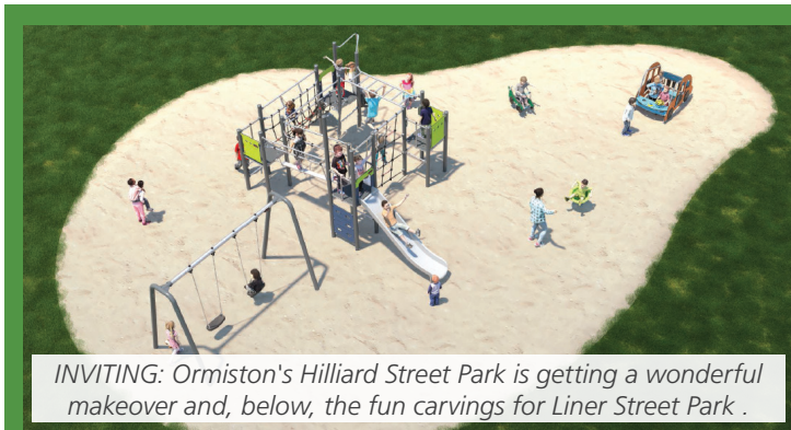
INVITING: Ormiston's Hilliard Street Park is getting a wonderful makeover and, below, the fun carvings for Liner Street Park .