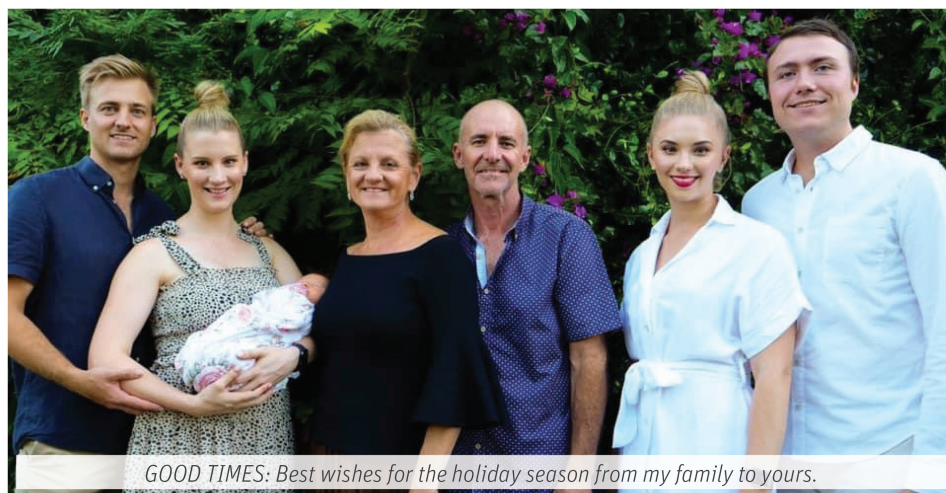
GOOD TIMES: Best wishes for the holiday season from my family to yours.