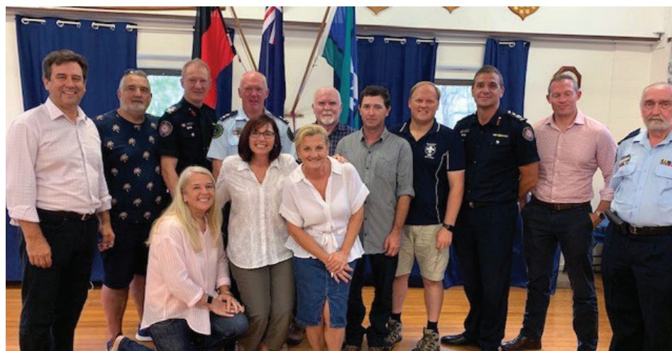
READY: Our volunteers are keen to get working with the new Brisbane Region Headquarters Rural Fire Brigade, Mount Cotton Service Group.