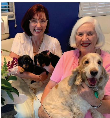
COMPANIONS: Furry friends have made it much easier for many of us to get through COVID-19 isolation.