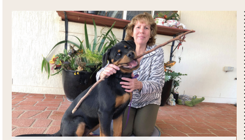
TAKING THE LEAD: With my neighbour's puppy Ruby.