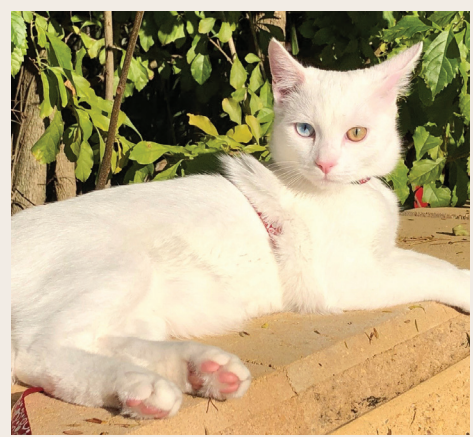
CONTAINED: Our beautiful George sitting on the front fence in the sun, happily secured by his lead and, left, our secure cat fencing.

There are designs available that will allow your cat to come and go from the house as it pleases while still being adequately contained on your property. Another suggestion is cat-proof fencing to ensure that your cat can't jump the fence into neighbouring properties and public spaces. The penalty for allowing a cat to stray is $266.