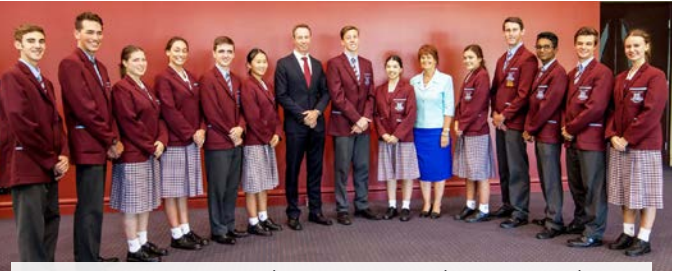
LEADERS: It was a pleasure to recently represent the Redlands at the Ormiston College prefect investiture.