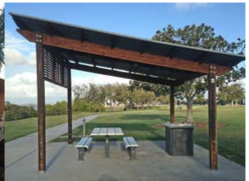
FAMILY TIME: The new barbecue facilities in Raby Esplanade, Ormiston.