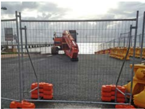
RAMP IT UP: Wellington Point boat ramp should be ready for the winter whiting run.