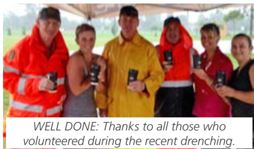
WELL DONE: Thanks to all those who volunteered during the recent drenching.