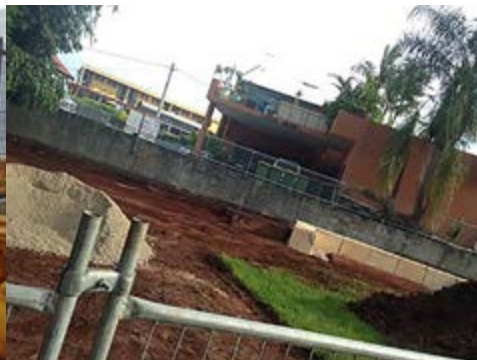
ON THE GREEN: Watch this space for a fun development at the Village Green.