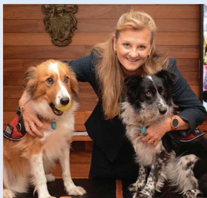
ON TRACK: Koala detection dogs such as Maya and Baxter are helping to save koalas.

The first step will be to identify stakeholders and the specific requirements for such a hub.