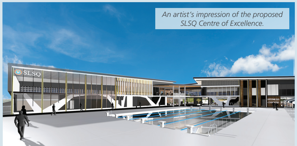
An artist's impression of the proposed SLSQ Centre of Excellence.

With a state election on the horizon, we will be seeking commitments from all candidates and we ask you to join us.