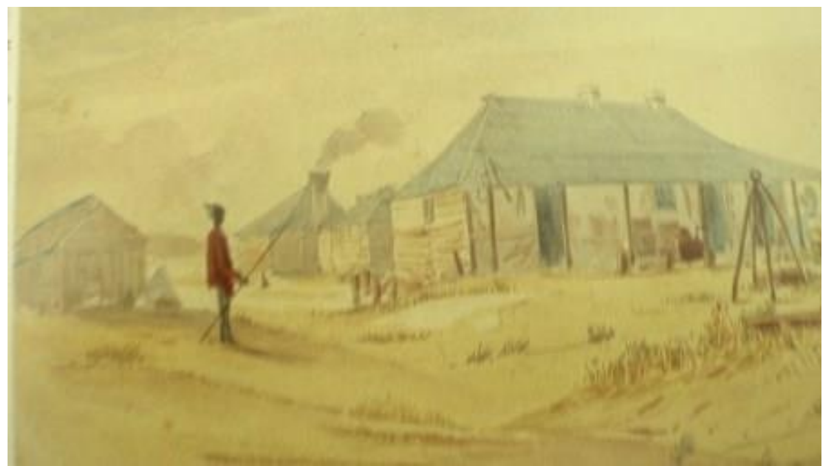
Pilot station Amity Point, by Owen Stanley

A pilot station was established at Pulan Pulan the following year in 1825, now renamed Amity Point by the Europeans.