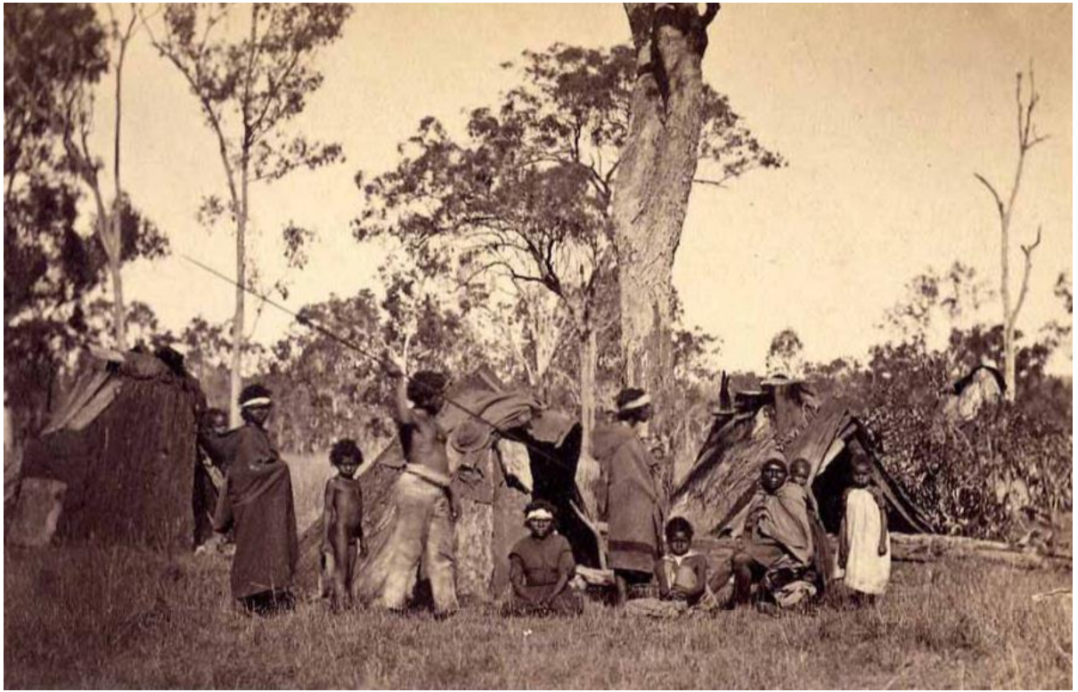
"Black Fellows' Camp" near Redland Bay Sugar Plantation, 1871