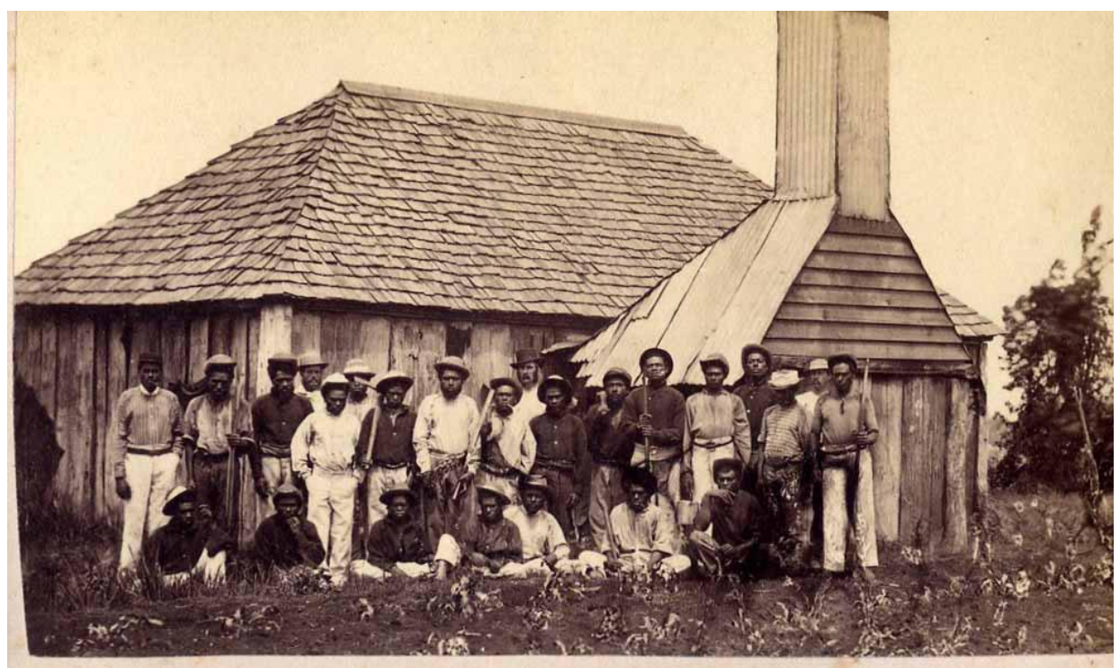
South Sea Islanders' hut with some of the Islander's employed in the Redland Bay Sugar Plantation, 1891 HP4383

It is possible that the Willard's original slab hut near the creek (their home while they erected a more substantial building) had become the Kanakas ' accommodation. Many lived in camps and villages with Aboriginal people.