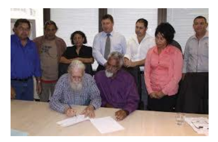
Image from Quandamooka People's native title determinations, North Stradbroke Island, 4 July 2011

Following the Native Title Recognition, in November 2012, Redland City Council relinquished management of the Minjerribah camping grounds to Straddie Camping, who work within a State Government framework. At that time many of the camps were struggling financially and included many long-term 'permanent' vans.