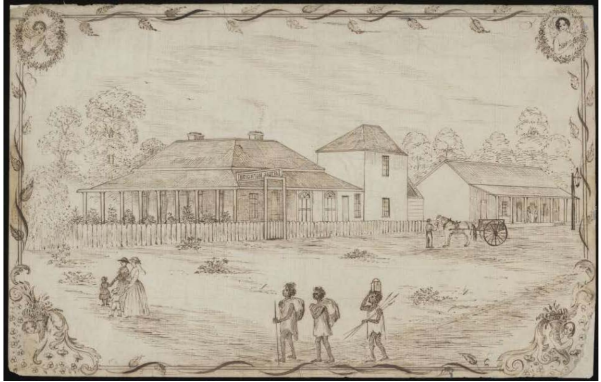
The Brighton Hotel (now Grand View Hotel) 1891