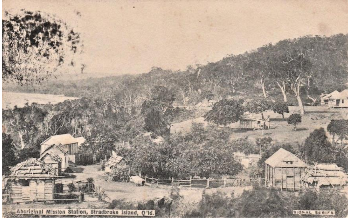
Aboriginal Mission Station, Stradbroke Island, Qld - circa 1909