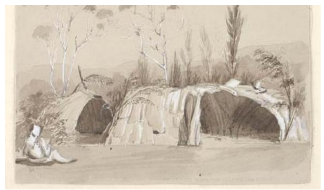
Aboriginal housing on Mulgumpin (Moreton Island) by Owen Stanley. Brisbane History Group 1992

The following year, 1824, was the beginning of a permanent European presence in Moreton Bay. In 1824 Oxley & Cunningham visited Pulan Pulan in the Amity and recorded seeing a number of Aboriginal huts on the sands above the beach. These were formed on a framework of saplings and partly thatched with tufts of grass and thin Melaleuca bark. Cunningham entered one through a low doorway and found it to be 50 feet (15.5 metres) across and more than 6 feet high, enough to shelter 40 people. They sat down with a group of men aged between 25 and 40, all well-built, many of them being over 6 feet tall and with scarified skin. The scars were marks of identification, called mulwarra or moolgarra .