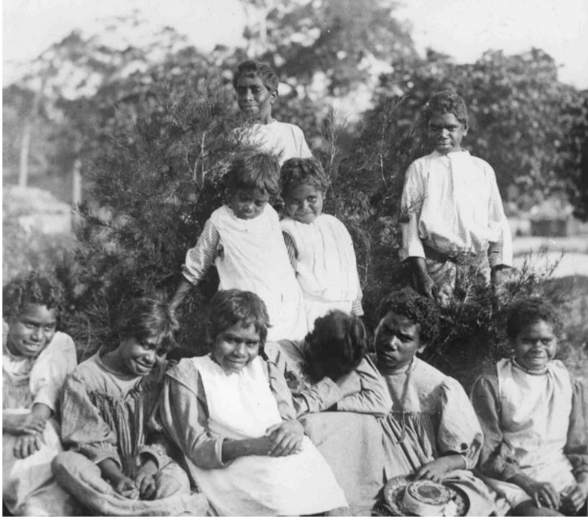
Children at Moongalba/Myora Mission, 1896

It moved again soon after, this time to Teerk Roo Ra (Peel Island) in November 1892 and the following year 1893 to Myora/Moongalba on Minjerribah.