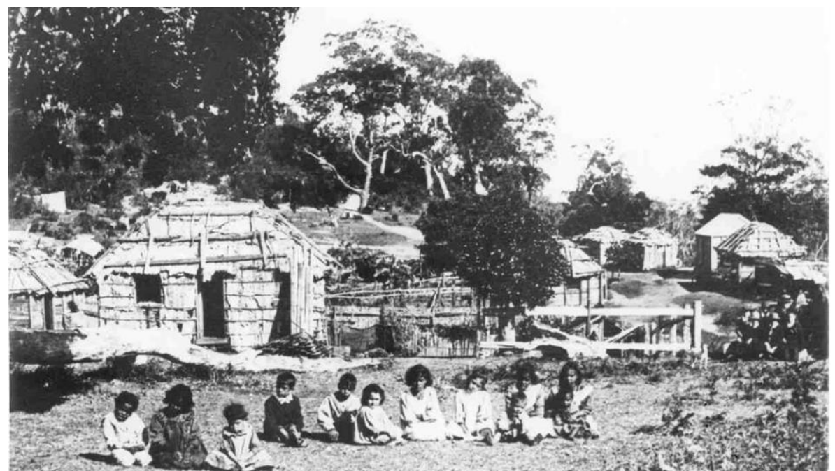
Children possibly at the school, location & date unknown.