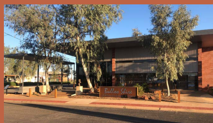
SUPPORT: Council is keen to see our islands get the same funding consideration and government services as remote centres such as Thargomindah in western Queensland.