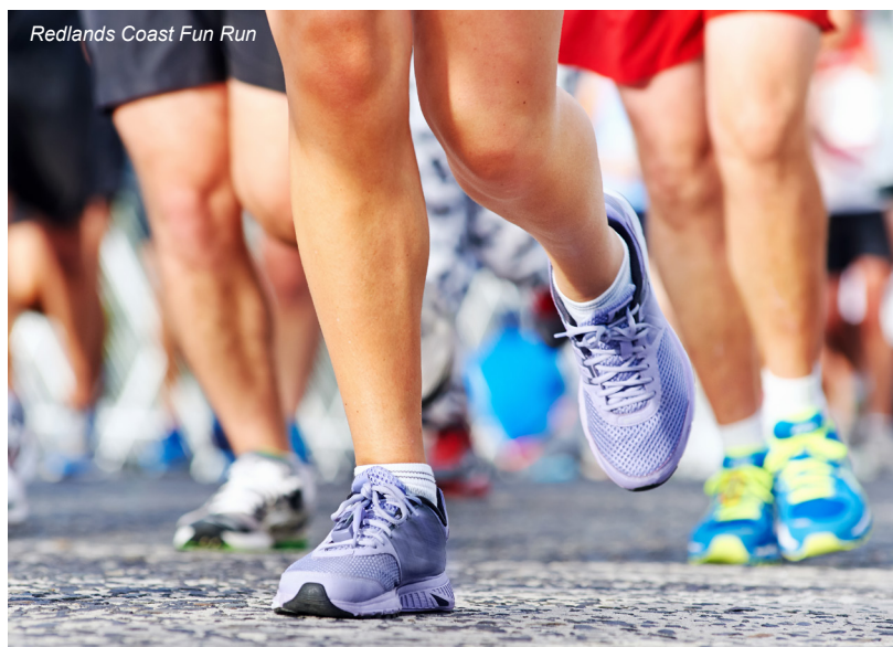
Redlands Coast Fun Run