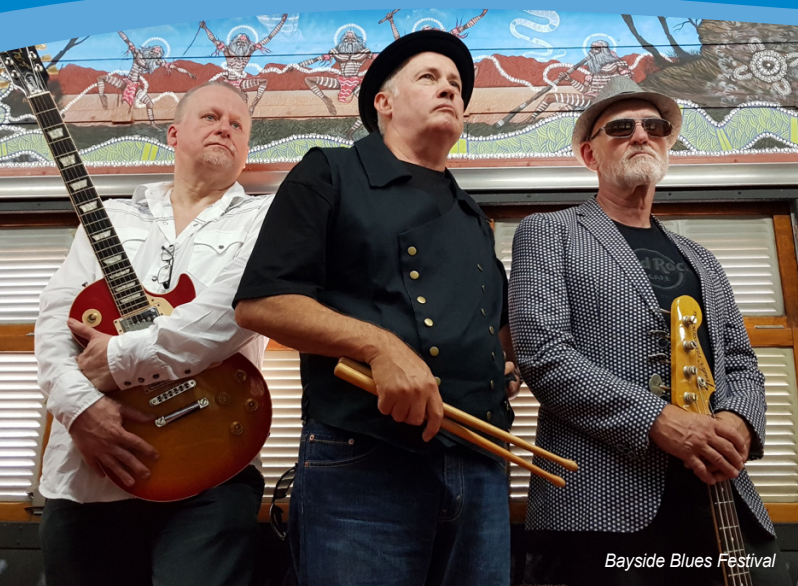
Bayside Blues Festival