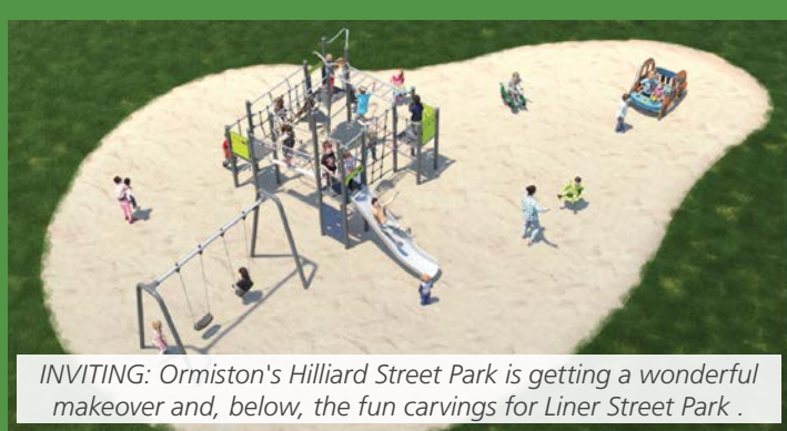
INVITING: Ormiston's Hilliard Street Park is getting a wonderful makeover and, below, the fun carvings for Liner Street Park .