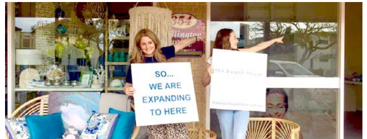
INVESTMENT: Business expansion is a positive sign for Wellington Point Village.

The new Wellington Point Farm tourist destination will also increase visitations to our area. Please continue to support our local businesses as that is what keeps them open and local. As a former small-business owner, I am passionate about supporting our local businesses and have been working to have a street light policy adopted by Council to further enhance our business areas. During the trial at Wellington Point Village I have been working with traders to ensure they are supported in lighting up their footpaths. A few more wonderful surprises are being planned, especially for Christmas and beyond.