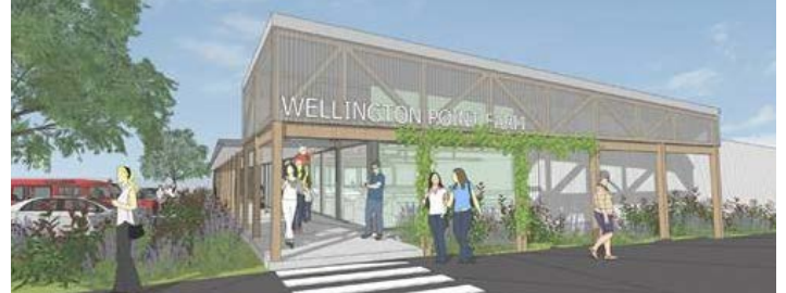
ATTRACTION: Wellington Point Farm is set to become a new tourism destination for Redlands Coast.

Please continue to stay in touch and feel free to email me at wendy.boglary@redland.qld.gov.au or call 3829 8619 or 0408 543 583 if I can assist.