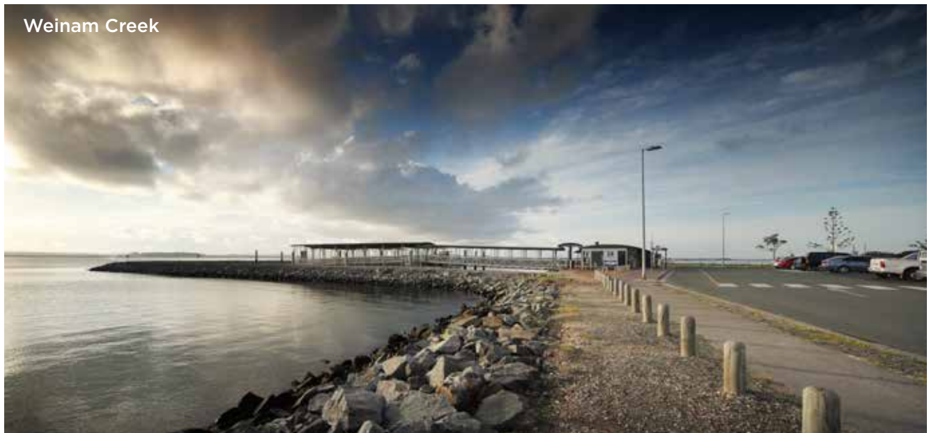
Artist Impression: Weinam Creek