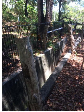
Cattle Dip, Point Lookout (AHS, 2017).