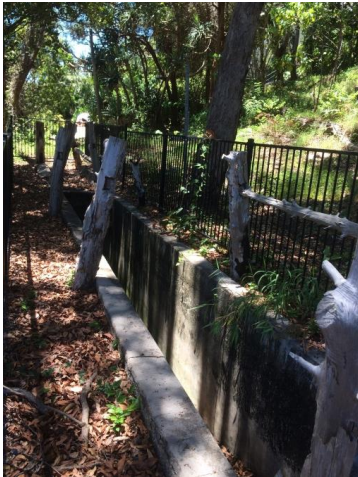
Cattle Dip, Point Lookout (AHS, 2017).