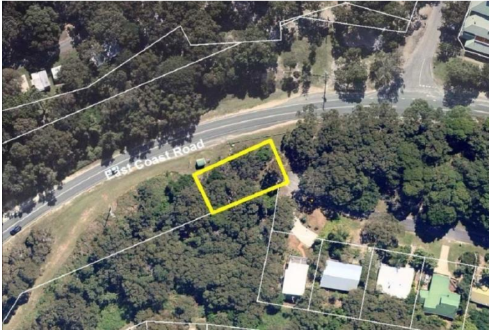
Red-e-map (RCC, 2017).