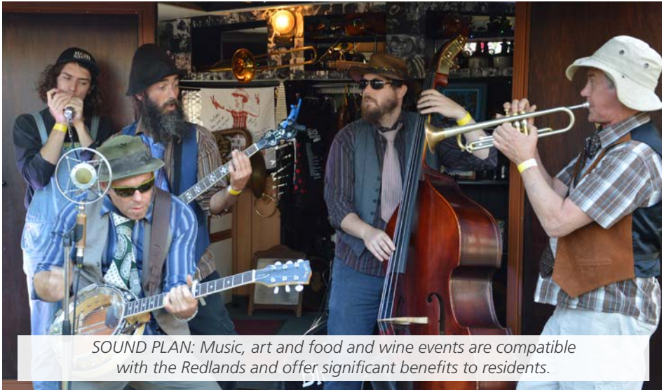
SOUND PLAN: Music, art and food and wine events are compatible with the Redlands and offer significant benefits to residents.