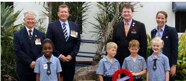
HEART-WARMING: Schools such as Faith Lutheran showed great respect for our ANZAC traditions.