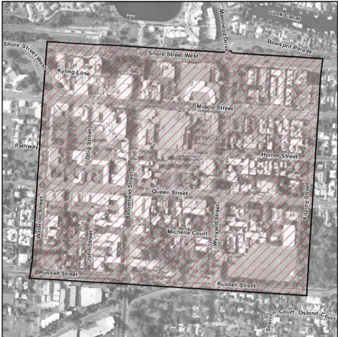
Schedule 3 - Part 2 Map 2: Cleveland Declaration of No Parking Permit Area