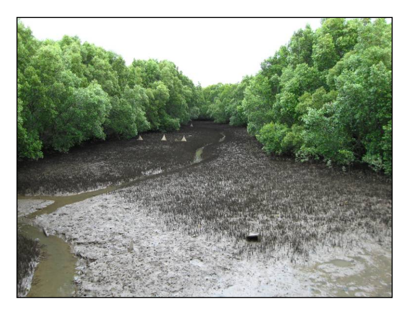
Typical C. longior and C. ornatus breeding site in a small mangrove creek.