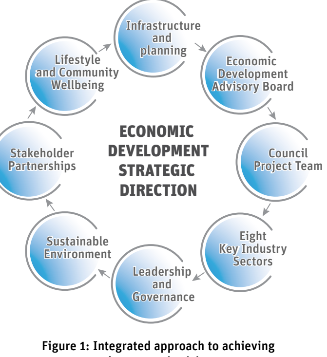
the economic vision

This third Board annual report – a requirement under the Redlands Economic Development Advisory Board Terms of Reference – provides an overview of the Board's achievements for the period July 2018 to June 2019