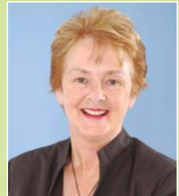
Mayor Melva E Hobson