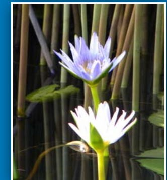
Friends of Russell Island Wetlands