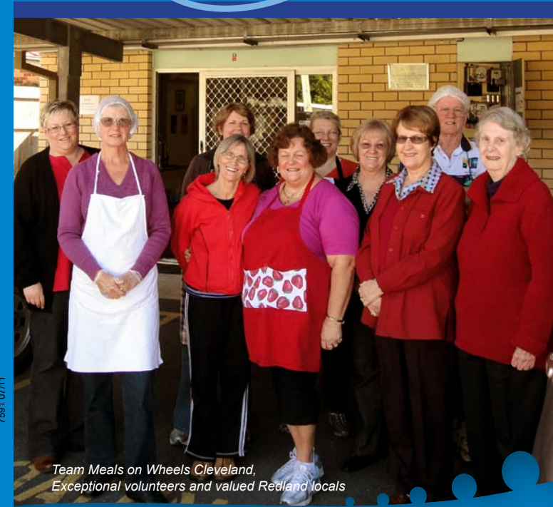
Team Meals on Wheels Cleveland, Exceptional volunteers and valued Redland locals